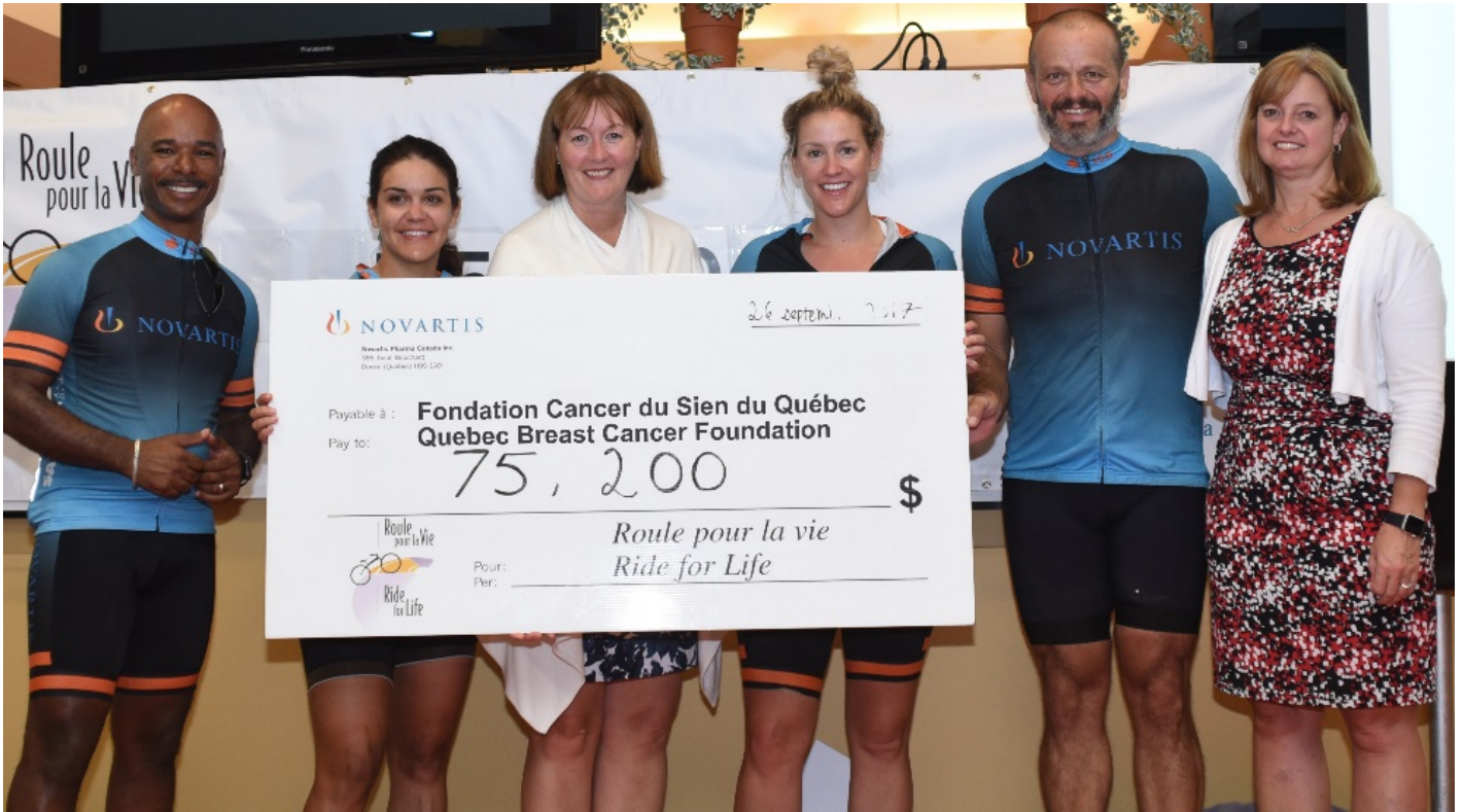
Congratulations to the riders and participants as well as those who generously donated to this worthy cause!