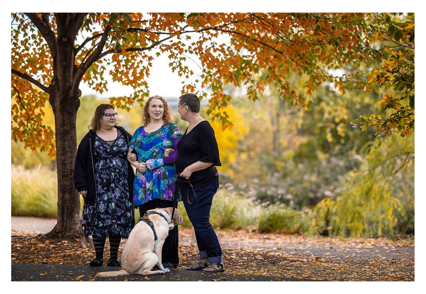
About The Novartis Health Equity Initiative 2/3